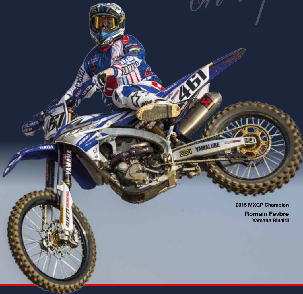
2015 MXGP Champion Romain Fevbre Yamaha Rinaldi